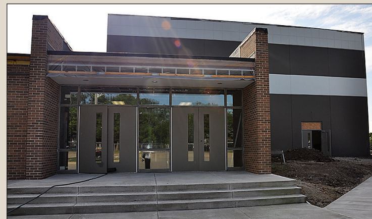
An outside look of the entrance to the new gymnasium and the gymnasium at Lincoln school.