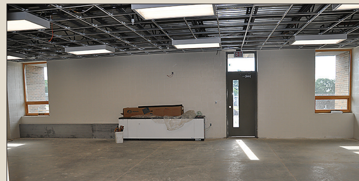
An inside look at one of the new classrooms at Lincoln school.