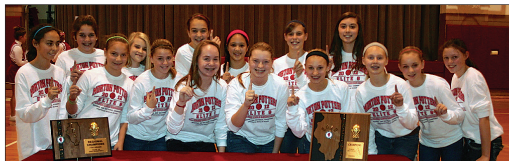
TOP: The 2016-2017 Lady Potters won their 3rd consecutive 3A IHSA State Championship title. BOTTOM: The 2012 MJHS Girls Basketball team.