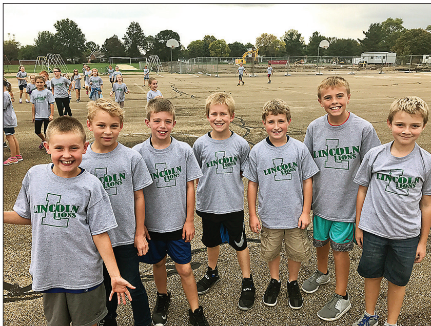
The Lincoln School PTO Walk-a-Thon is the primary fundraising activity of the PTO. Funds raised from the 2016 Walk-a-Thon helped to provide new playground equipment, student lockers, science materials and equipment, along with a wide variety of other items to benefit the students and teachers at Lincoln.

► At the end of the year, one 6th-grade girl and one 6th-grade boy are recognized with the Ruth Myers Citizenship Award. This award has been given annually to outstanding students at Lincoln School since 1989. The names of the winners from 1989 until present are located on a plaque inside the front door of Lincoln School.