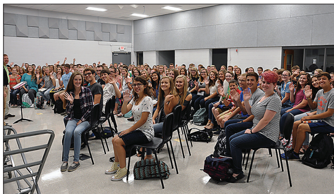
The updated MHS band room has all of the band students smiling as they have more room and storage for all of the instruments.

Phone: 263-8585. Counselors will be in the office starting July 31 to handle scheduling needs. Office hours are 7 a.m. – 3 p.m. through Aug. 14. Beginning Aug. 15, the counselors will be available from 7:50 a.m. – 3:30 p.m. daily. Appointments should be scheduled in advance.