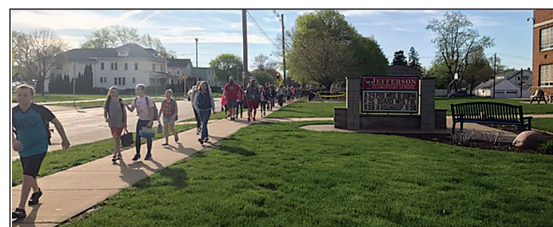
TOP: Jefferson students sporting their Patriot gear.