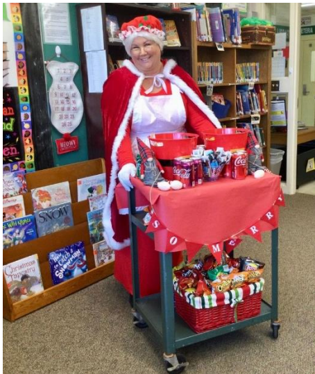
Mrs. Claus delivers the goods at Grundy